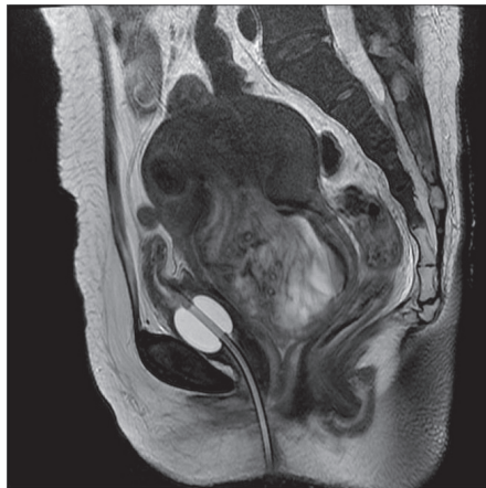
Figure 1. Sagittal magnetic resonance image demonstrates a 7.5 \times 6.7 \times 9.5 cm pedunculated mass at the upper vaginal cavity wherein the stalk is connected to the upper endometrium.

A 49-year-old woman (gravida 1, para 1) visited the emergency department due to persistent vaginal bleeding for a month, with severe difficulty in voiding. She had a history of hysteroscopic myomectomy 4 years prior. She had no other obstetrical or past medical history. On pelvic examination, a fibroid mass, which was occupying the whole vagina, was found. Because of the mass transvaginal sonography (TVS) was impracticable. Magnetic resonance imaging (MRI) showed a 7.5 \times 6.7 \times 9.5 cm pedunculated submucosal fibroid with secondary degeneration, which prolapsed to the vagina ( Figure 1 ).